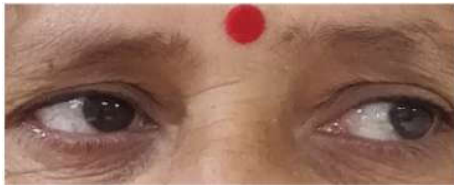
Fig. 1: Unaffected eyemovement to the left side.

was administered ASV (antislake venom). WBCT was repeated every 6 hourly which remained more than 20 minutes at all times so received total of 30 vials (300 ml) of ASV, after which possibility of Himalayan green pit viper snake bite was kept and no more ASV was administered. After 4 days of hospitalization patient complained of right eye pain and double vision. On examination patient was found to have right lateral rectus gaze palsy (Fig. 2). Patient was further examined by ophthalmology department who did not find any abnormality in refraction or fundus. The WBCT of patient was monitored once daily. Diplopia started improving gradually on the second day. On 10 th day the WBCT became less than 20 minutes and patient was discharged.